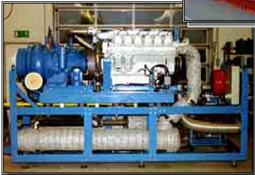
Turbo Blower for Sewage Plant (for Combined Heat and Power Generation) with MAN E 2842 E 302