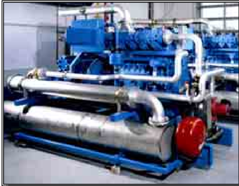
Screw Compressor for Heat Pump (for Combined Heat and Power Generation) with Waukesha F18G