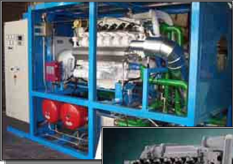
Cogeneration Unit 325 kW el

Standard Ratings, allow for Derating for Intercooling Temperatures above 35°C Units up to 3 MW on Request