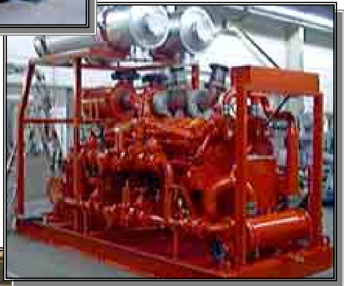
Pumping Unit with Cummins KTA 38