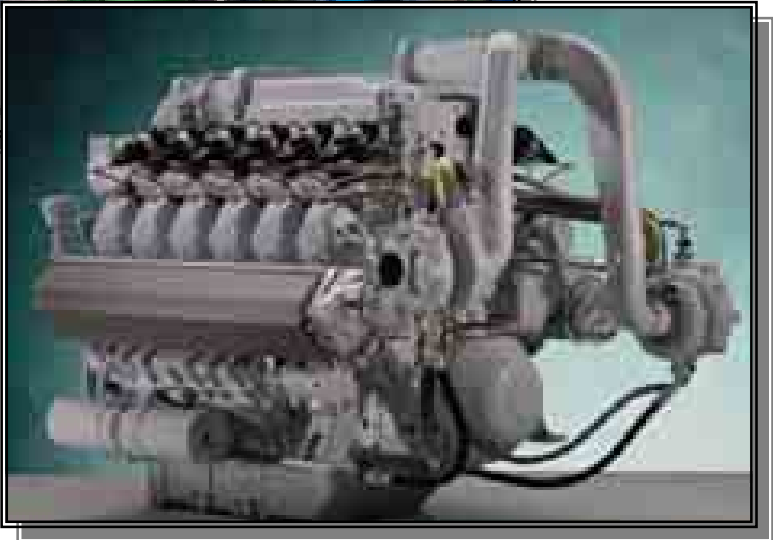
Gas Engine MAN E 2842 LE 302